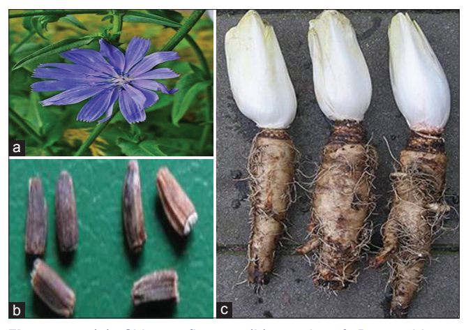
Figure 1: (a) Chicory flower; (b) seeds of Puna chicory; (c) blanched leaves and roots of Belgian endive

C. intybus L. var. foliosum (Hegi) Bisch. known as botanical variety salad chicory include three types of this plant: Belgian endive (also called witloof), sugar chicory (sugarloaf), and radicchio chicory (Italian/red chicory).<sup>[10]</sup> There are eleven types and cultivars of C. intybus L. var. foliosum (Hegi) (red chicory), i.e., "Palla Rossa 3," "Orchidea Rossa," "Indigo," "Fidelio," "Rosso di Verona," green – leaf: "Grumolo bionda,"